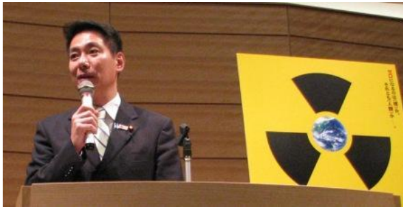
Japanese Foreign Minister Seiji Maehara opening the PNND showing of Countdown to Zero in the Japanese parliament theatre, October 2010

* 20 October, PNND Japan organises a screening of Countdown to Zero in the new Japanese Parliament theatre. The screening is opened by Foreign Minister Seiji Maehara.