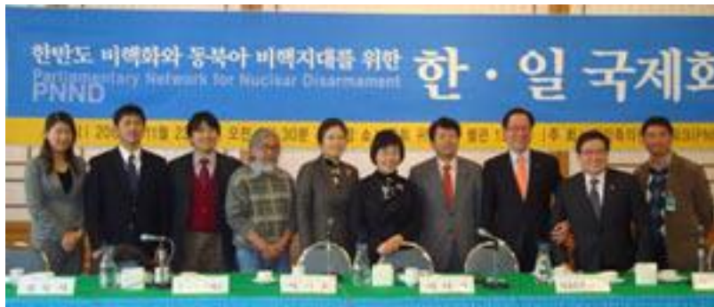
PNND Japan and PNND Korea initial meeting to discuss a North-East Asian Nuclear Weapon Free Zone

* 19 April, 2010. PNND sends a letter, signed by cross-party parliamentarians from nuclear-sharing nations (Belgium, Germany, Italy, the Netherlands and Turkey), to President Obama expressing support for his vision of a nuclear weapons-free world, and supporting proposals for the withdrawal of the remaining US nuclear weapons deployed in Europe . The letter also calls on the US and Russia to work on the elimination of all tactical nuclear weapons.