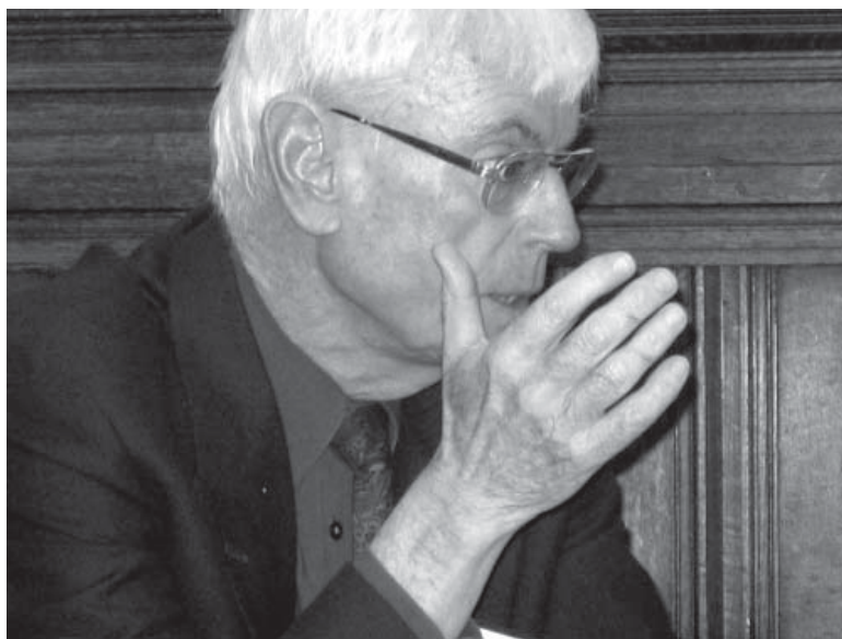
Ambassador Robert Grey, Jr. (ret)

Policy, Netherlands Ministry of Foreign Affairs, said, “The old paradigm was unraveling” even as the 2000 Review Conference agreed to the 13 Steps. That paradigm is suffering from “inconsistencies or anomalies,” he added. One inconsistency is the “ideological distress” placed on the NPT by the “diminution” of the importance of “essential conviction” behind the treaty, that there needs to be “some limitation of national sovereignty” in order for the treaty to function. Another inconsistency is the fact that three nuclear powers remain outside the NPT; in particular the treaty is “frozen in time” in that India can not join the NPT as a nuclear state, “the historical anomaly can no longer be maintained,” Mr. Wilke said.