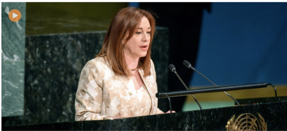
Foreign Minister María Fernanda Espinosa Garcés of Ecuador, newly-elected President of the 73rd Session of the United Nations General Assembly, addresses Member States.

GSI is proud that the UN elected Ecuador Foreign Minister Maria Fernanda Espinosa to be the incoming President of the UN General Assembly. She will become the 73rd person, and the fourth woman ever, to hold the UNGA presidency.